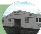
Fundraiser for the Mahoenui Memorial Hall

Full Payment to secure spot Limited number so get in quick!