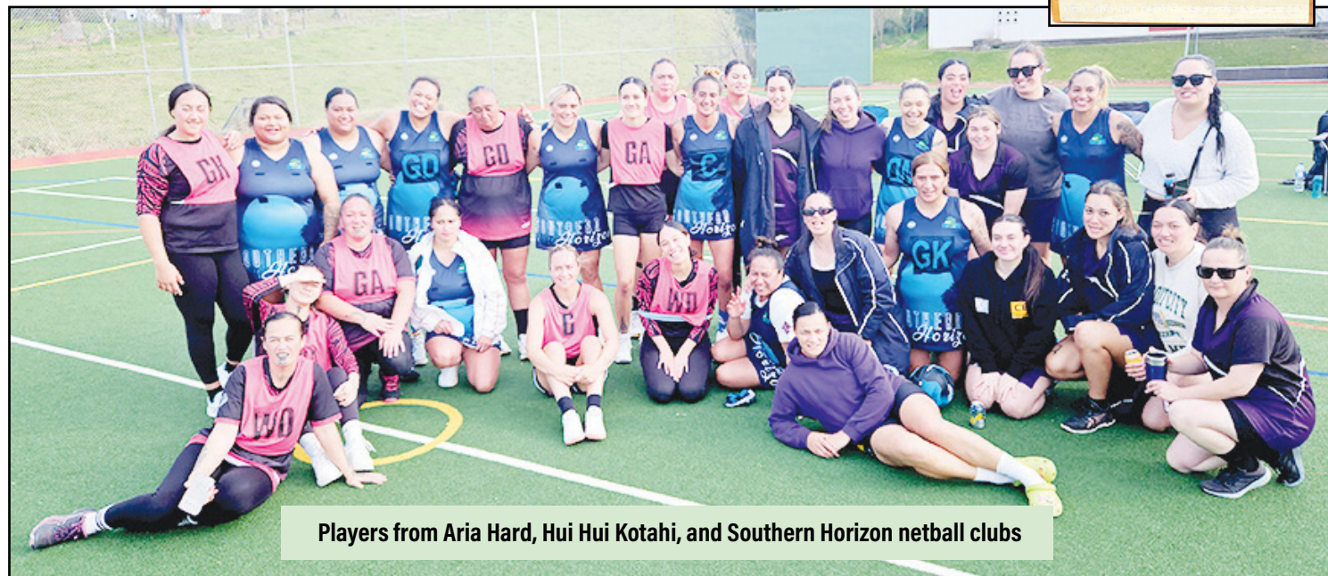
Players from Aria Hard, Hui Hui Kotahi, and Southern Horizon netball clubs