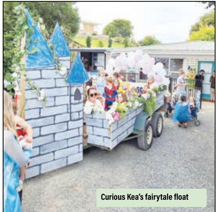
Curious Kea's fairytale float