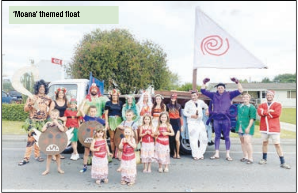
'Moana' themed float