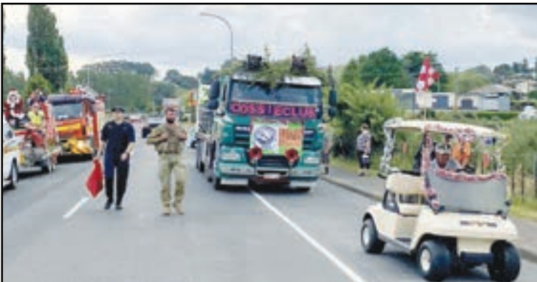
Piopio Christmas Parade Float shield winners: Pari whanau.