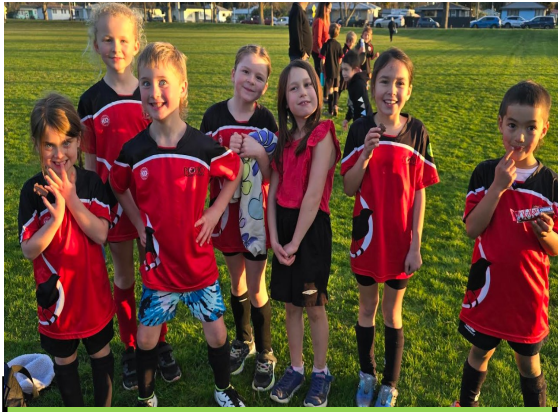
Soccer : PP Sparrows