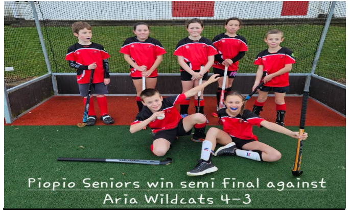
Hockey: PP Seniors