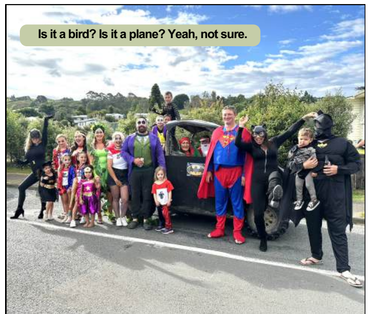
Is it a bird? Is it a plane? Yeah, not sure.