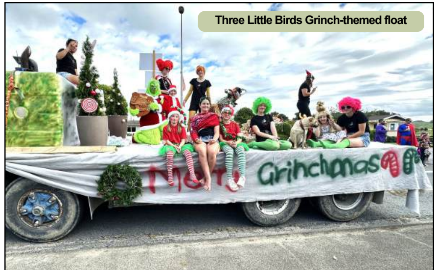
Three Little Birds Grinch-themed float

Also, a big shoutout to Jessie Loomans for winning the Piopio Christmas stocking raffle.