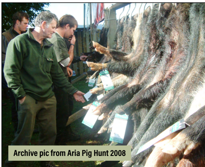
Archive pic from Aria Pig Hunt 2008

We've added more categories with deer and fishing. With the fishing we've gone with heaviest and average kahawai weight. We wanted to add this section to give an even playing field for all fishermen.