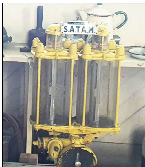
LEFT: S.A.T.A.M. - what does this stand for?

All meetings are held at the Piopio Senior Citizens Rooms.