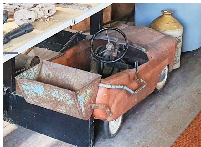
BELOW: There were plenty of horses to shoe, but what about the use of these tools?